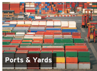
Ports & Yards