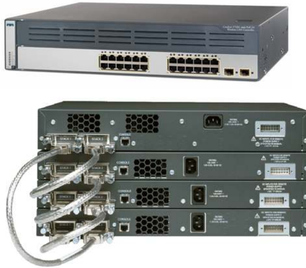
Figure 2. Unified Wireless LAN with the Cisco Catalyst 3750G Integrated Wireless LAN Controller